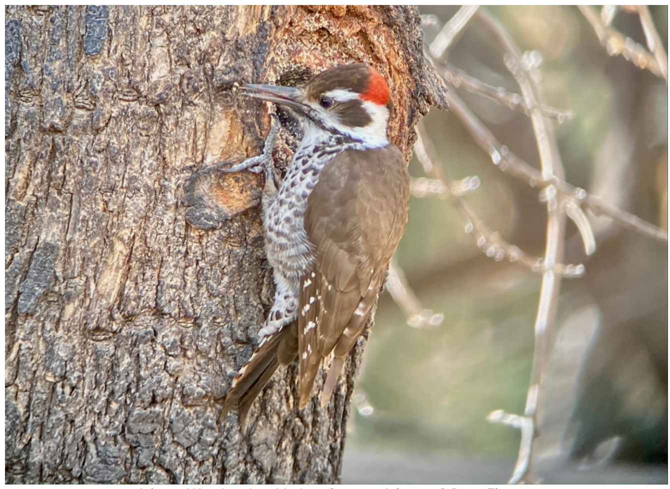
Arizona Woodpecker, Madera Canyon, Arizona

Spotted towhees. In nearby Green Valley, the xeriscaped residential areas should produce such desert species as Gambel's Quail, Costa's Hummingbird (uncommon), Gilded Flicker (declining), Gila Woodpecker, Cactus Wren, Curve-billed Thrasher, Black-tailed Gnatcatcher and Pyrrhuloxia.