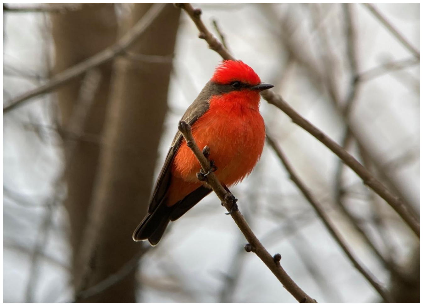
Vermilion Flycatcher, Continental, Arizona, © Barry Zimmer

January 25, Day 7: Departures for Home. Participants may plan to depart for home at any time today. If you have time and plan on extending your stay in Tucson, you are encouraged to visit the unique Sonora Desert Museum, west of Tucson. A remarkable exhibit of living flora and fauna can be observed here, all from the Sonora Desert of southern Arizona and northwestern Mexico.