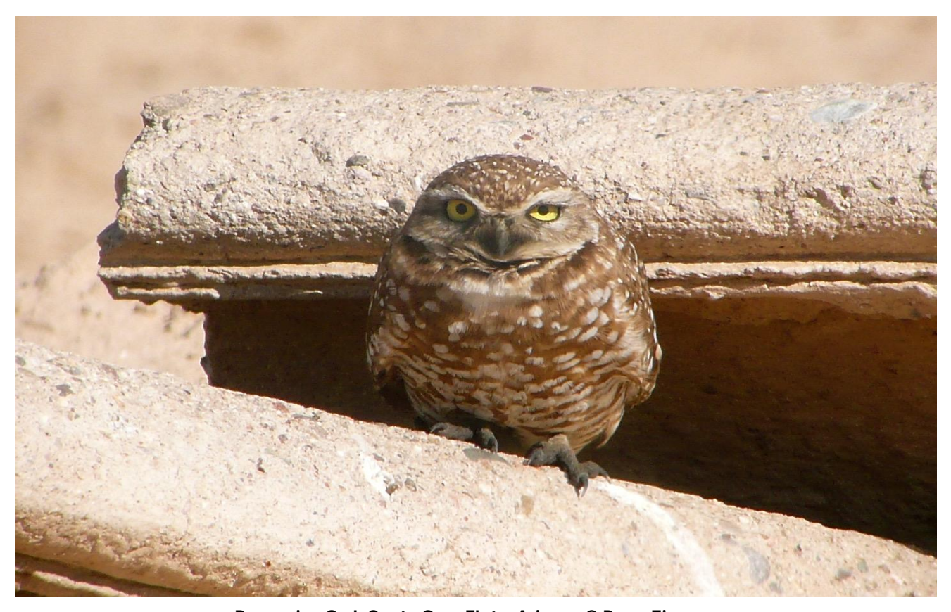
Burrowing Owl, Santa Cruz Flats, Arizona

January 22, Day 4: Patagonia/Nogales. Most of today will be spent in the bird rich riparian habitats that line Sonoita Creek and the Santa Cruz River. Cottonwood forests along the Santa Cruz River often harbor Common Ground-Dove, the spectacular Vermilion Flycatcher, Gray Flycatcher, and skulking Crissal Thrashers and Abert's Towhees.