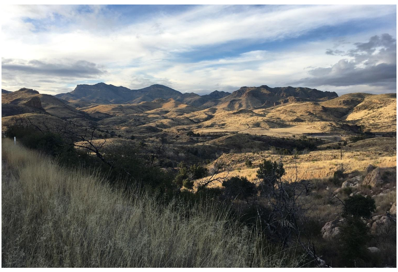
Pajarito Mountains, Arizona

This tour may be combined with our "Winter Southern California" tour January 13-19, 2026 which immediately precedes this trip with five full days of superb birding from San Diego to the Salton Sea.