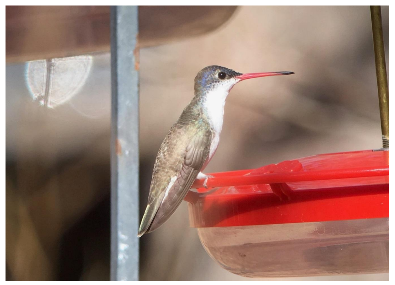
Violet-crowned Hummingbird, Patagonia, Arizona

January 23 Day 5: Sulphur Springs Valley. A longer drive today will lead us to the birdy Sulphur Springs Valley. This area is renowned for its great raptor viewing with uncommon species such as Ferruginous Hawk and Prairie Falcon likely during the course of the day. Red-tailed Hawks and Northern Harriers abound, and there should be a sprinkling of accipiters as well. Toward the southern end of the valley large concentrations of Sandhill Cranes (about 20,000) gather around Whitewater Draw. The sights and sounds of thousands of cranes at once is always a highlight. Whitewater also attracts a good variety of waterfowl and may harbor Snow and Ross's goose, Wilson's Snipe, Horned Lark, Black Phoebe, and Vermilion Flycatcher. The grasslands and agricultural areas of the valley also host large numbers of wintering sparrows with Lark Bunting and Brewer's Sparrow among the expected species. Other targets here include Scaled Quail, Great Horned and Barn owls, Bendire's Thrasher, Crissal Thrasher, and possibly longspurs.